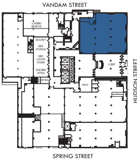
Key Plan - Not to scale