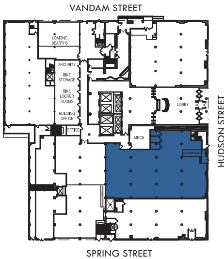
Key Plan - Not to scale